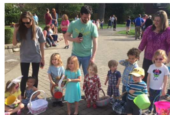
Arkbuilders Easter Egg Hunt