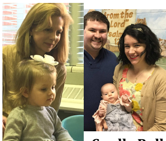
Cradle Roll Class