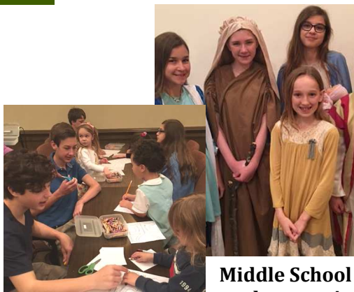
Middle School students assist with Sonshine Class

Thank you GWP family for your generous support of the Inner City Catfish dinner. Your gifts totaled over $8,500.